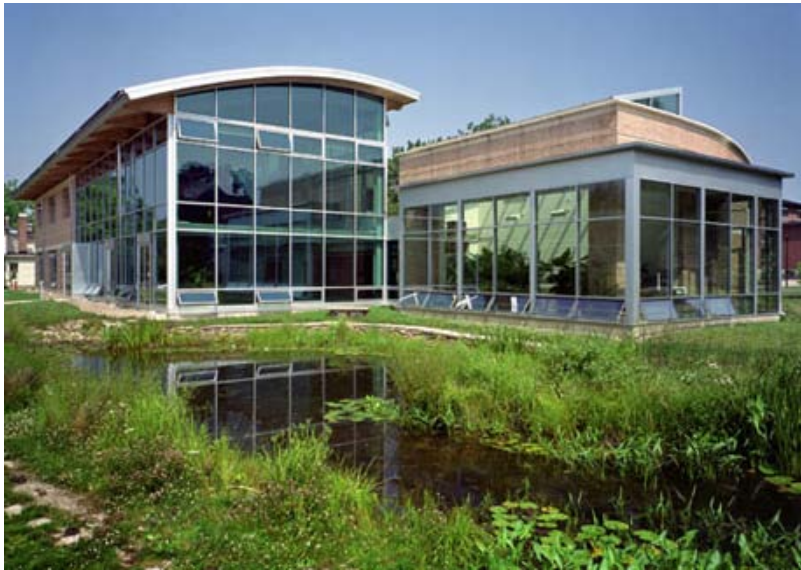
Adam Joseph Lewis Center for Environmental Studies. Retrieved on April 20, 2011 from http://curiosity.discovery.com

Design all new Federal buildings to achieve zero-net energy by 2030.